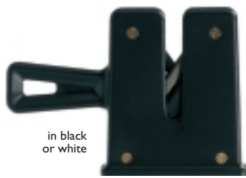
in black or white SHEFFIELD CHOICE PLUS SHARPENER 3030