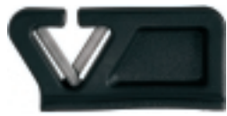
MICRO SHARPENER 1200